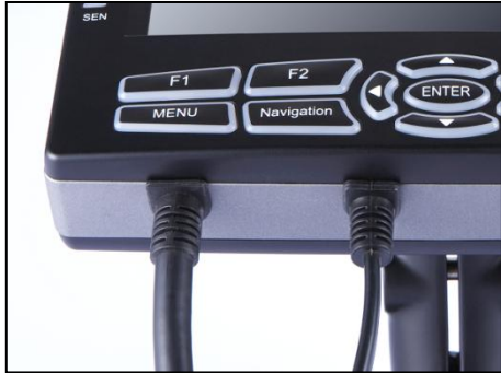
All-in-one cable (total 32pin assignment)