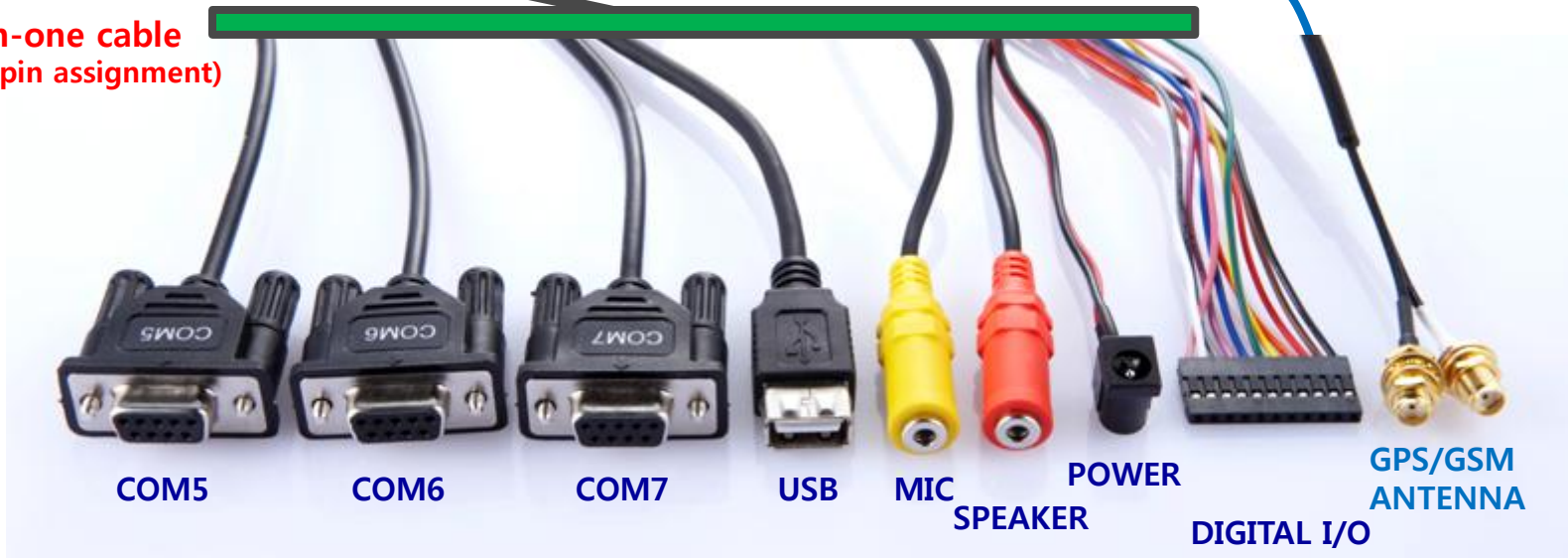
GPS/GSM antenna connector extension cable